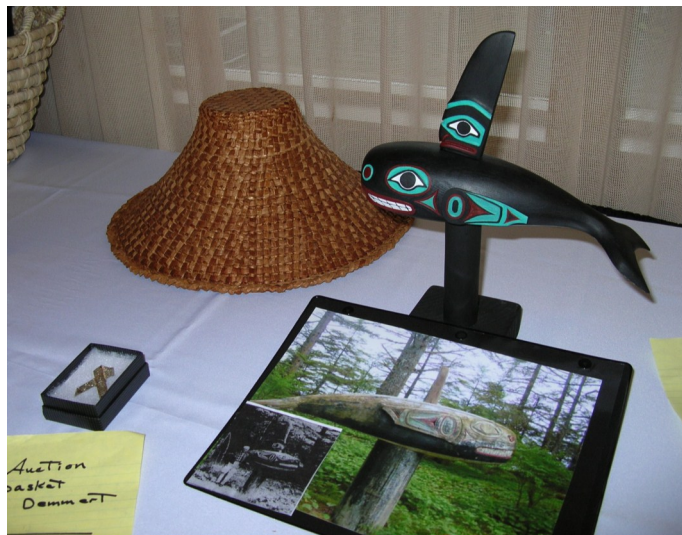
Cancer Awareness Pin, Haida hat and hand carved Killer Whale totem replica—just a few of the donated items at the KHHF auction/raffle.